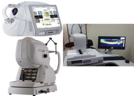
Fig. 1. OCT devices examined in the study (Cirrus HD-OCT, AngioVue HD-OCT, DRI HD-OCT Angio Triton SS)

thicknesses of the retinal nerve fiber layer (RNFL) measured by Cirrus HD and Stratus OCT instruments. 10 They used a cross-sectional study with 6 healthy, 48 glaucoma subjects, and 55 subjects with glaucoma. The participants were measured by a single trainer operator by using the devices. RNFL thickness as determined by two OCT devices showed a correlation with r = 0.94 and P < 0.001 , but significantly distinct measurements were found. Also, there existed some significant differences in RNFL thickness and normative classification despite a high degree of correlation on the RNFL thickness. Largely, Cirrus OCT showed more sensitive and higher specificity.