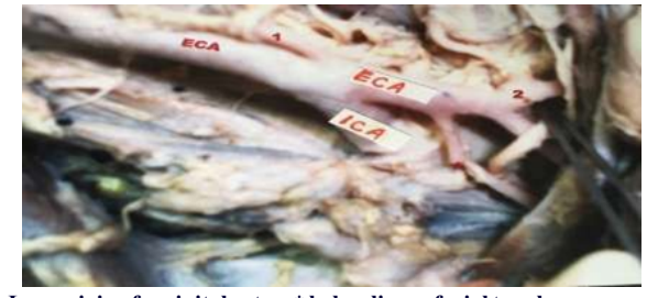
Low origin of occipital artery* below linguofacial trunk