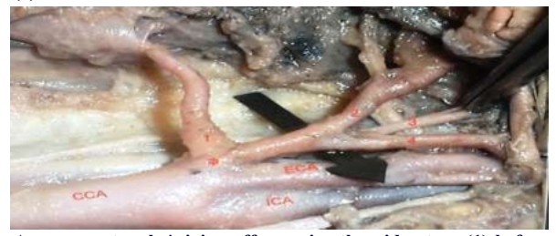
A common trunk *giving off superior thyroid artery (1) before trifurca

Ascending pharyngeal artery (1) stemming from occipital artery (2) 3.