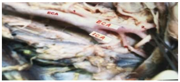
Linguofacial trunk (2) 4b.

External Carotid Aretry 'is development is a complicated process of angiogenesis and remodelling which includes annexation and regression of vessels. The development of hyostapedial artery which links the neural crest arterial system to the ventral pharyngeal arterial system is an important event in the development of external carotid artery. Signals involved in annexation and regression are not always synchronized which results in various anatomical variations[14]. A case report was found which showed an anomalous glandular branch arising