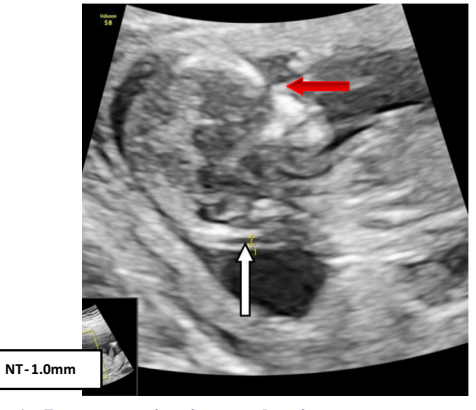
Fig 1: Representative image showing measurement of normal nasal bone(red arrow) and nuchal translucency(white arrow).

This is a prospective study of 100 singleton pregnancies at 11–14 weeks gestation. The study population comprised women between 20-30 years of age who attended the antenatal clinic for regular checkups between December 2018 and March 2019. Routine fetal biometry, measurement of NT, assessment of nasal bone, and Doppler study of Ductus Venosus was performed according to a standardized protocol. They were followed up for the entire period of pregnancy until delivery. Ultrasound examinations were performed trans-abdominally using a GE Voluson S8 ultrasound machine with a 2-6 MHz curvilinear probe.