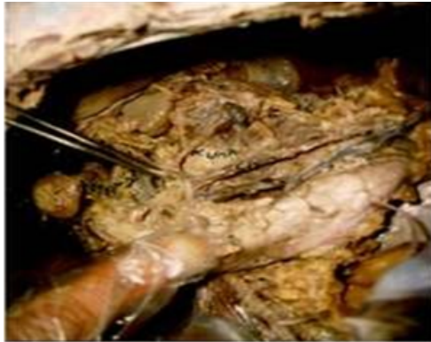
Fig 1 : Coeliac Trunk - Classical Type Of Branching

b). Trifurcation (Fig. No 3) of Coeliac trunk was seen