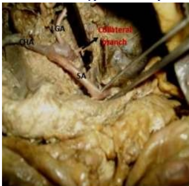
Fig 4 : Coeliac Trunk - Showing Collateral Branch

in 16 cases (45.7%) out of 35 bodies. In this the Left gastric, common hepatic and splenic arteries are trifurcating at the same level forming Haller's tripod.