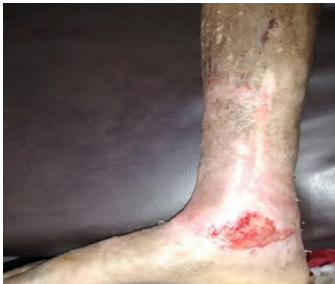
4. Assessment of wound on day 30

Attached below is the wound of the patient as seen on day 20 of the study: