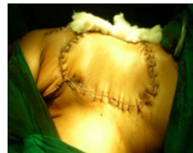
C. Reconstruction by Latissimus dorsi flap

All patients underwent radical mastectomy of the affected side. Reconstruction was done by Latissimus dorsi muscle flap.