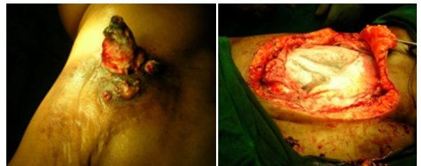
A. Recurrent Phyllodes Tumor B. Radical Surgery Performed

Retrospective study of recurrent phyllodes tumors, managed in our hospital for last 10 yrs. All women with palpable breast lump of any age attending our hospital during that period and treated with wide local excision or mastectomy and histopathology reported as phyllodes tumor were retrospectively analyzed and included in the study.