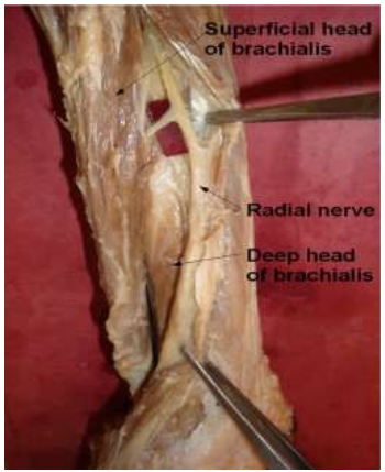
Fig. 2: Radial Nerve Branch Entering Into The Superficial Head Of Brachialis Muscle